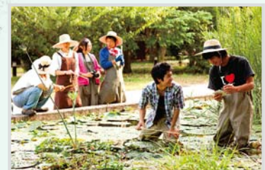
G Studying water quality of the pond