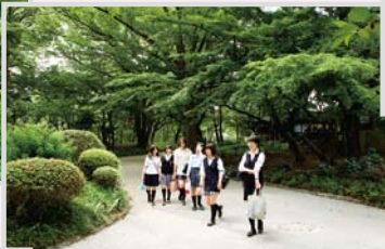
B Walking up the slope to school