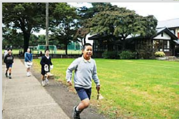
D Ringing the school bell to tell the time