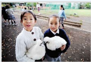
E Raising silkie chickens