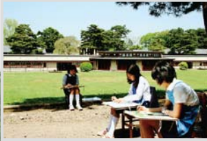
P Outdoor sketching lesson