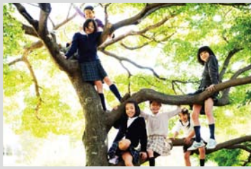
C Climbing trees