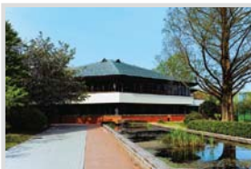
H The Memorial Auditorium