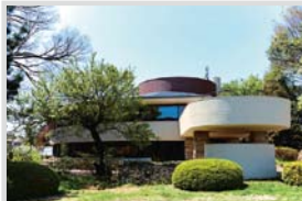
I The Library