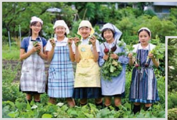
A Harvesting turnips