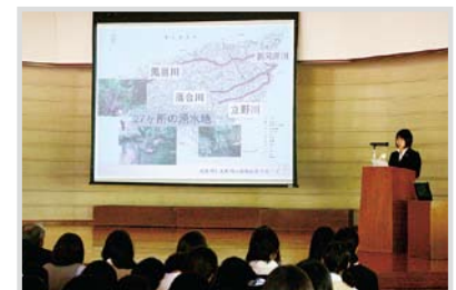
A seminar presentation