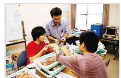
Practical archaeology lab program