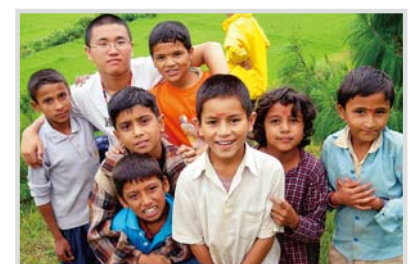
Nepal work camp